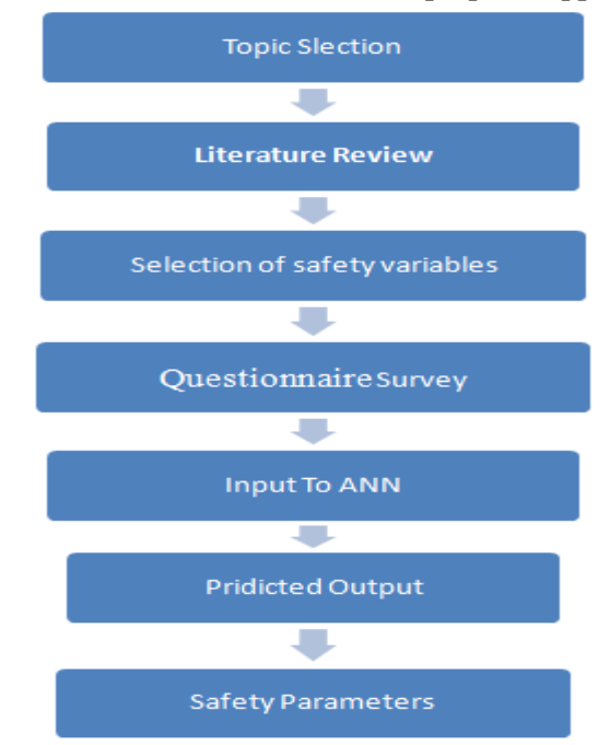
Figure 2: Methodology of flowchart

The below figure 2 show the how overall work will be execute the proposed approach